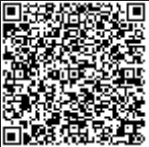
LOCATION QR CODE