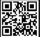
WEBSITE QR CODE